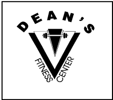
FIGURE CONTEST WAIVER